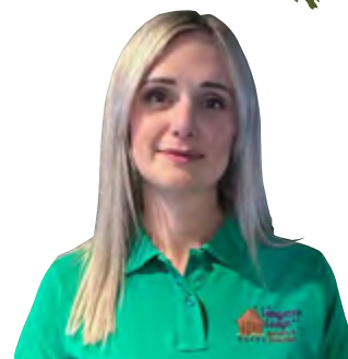
Charlotte General Manager