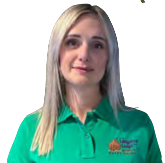
Charlotte General Manager